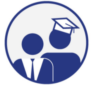
INTERNSHIPS & EMPLOYMENT